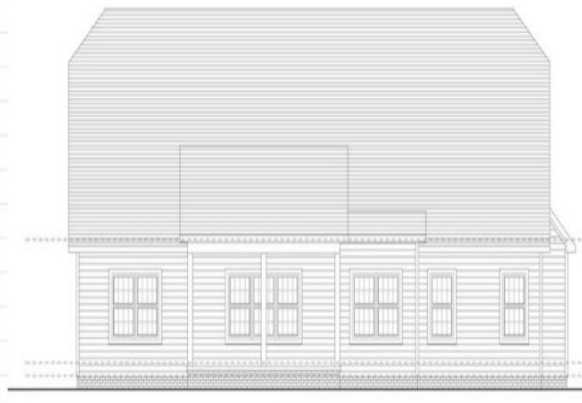
201 REAR ELEVATION