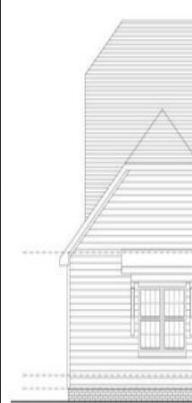
201 FRONT ELEVATION