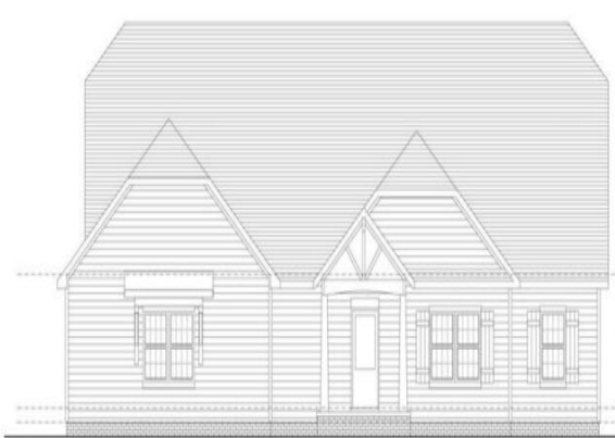
201 FRONT ELEVATION 1/4" = 1'-0"